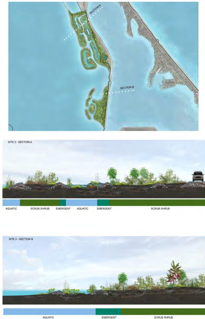
Figure 2. Conceptual Post-Construction Cross Sections.

Each phase consists of a number of cells which will utilize a mixture of armor stone, wooden structures, and other natural materials to construct basins for placement of dredged material. The focus of the final plan is to create nearshore wetland areas with variations in water depth, water flow, and native wetland vegetation. Multiple habitat types are built into the designs to increase potential for usage by fish and wildlife . Figure 2 provides a cross-sectional views of how the wetland may look after dredge material placement and plantings.