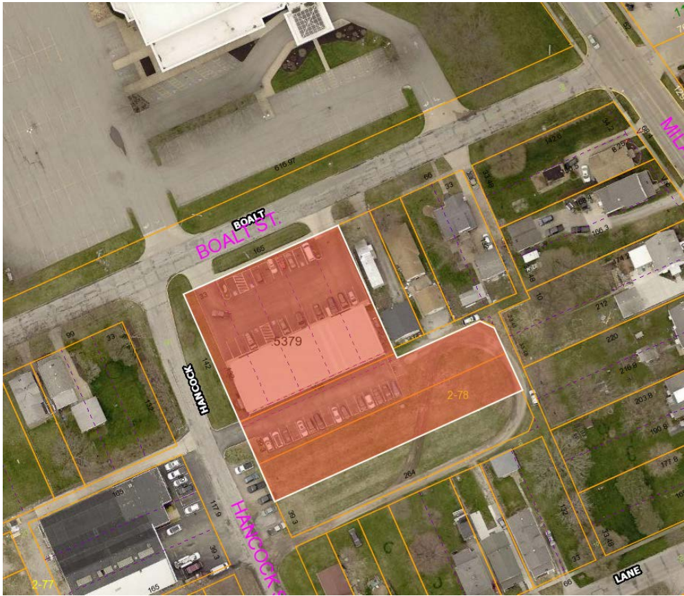
Zone Map – Parcels Indicated